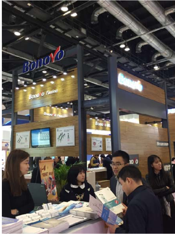
Sales explaining to the doctors about Bonovo's products