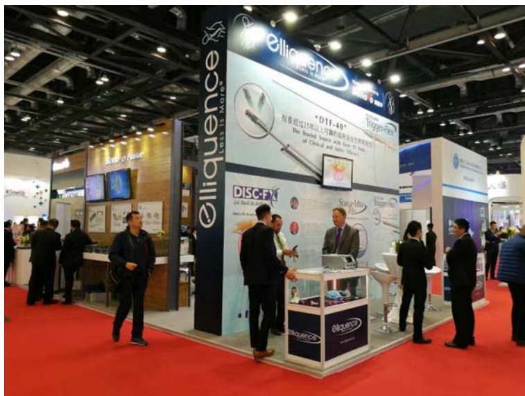
Elliquence exhibition booth