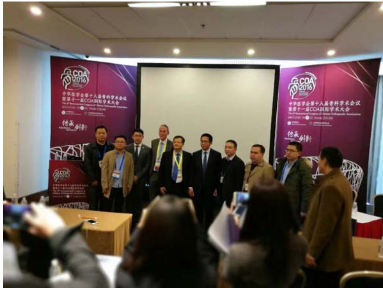
Group photo of the satellite symposium