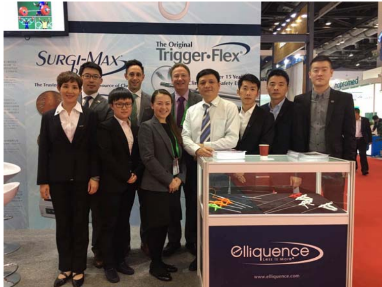
Elliquence group photo